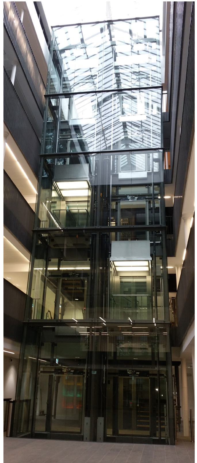
Severndale House Manchester: see case study on our website

*Dependant upon lift speed &, or load capacity contact ikonic lifts for details